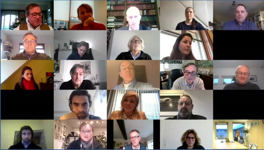
EHN General Assembly online – 8 December 2020