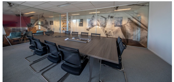
Belgicastraat 9 B 2 – 1980 Zaventem

The Belgian Equestrian Federation welcomes us in their modern premises in Zaventem where EEF and CBC, members of EHN are already based.