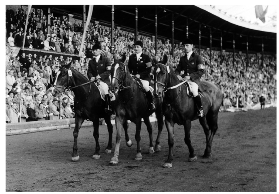
First participation for women in Jumping